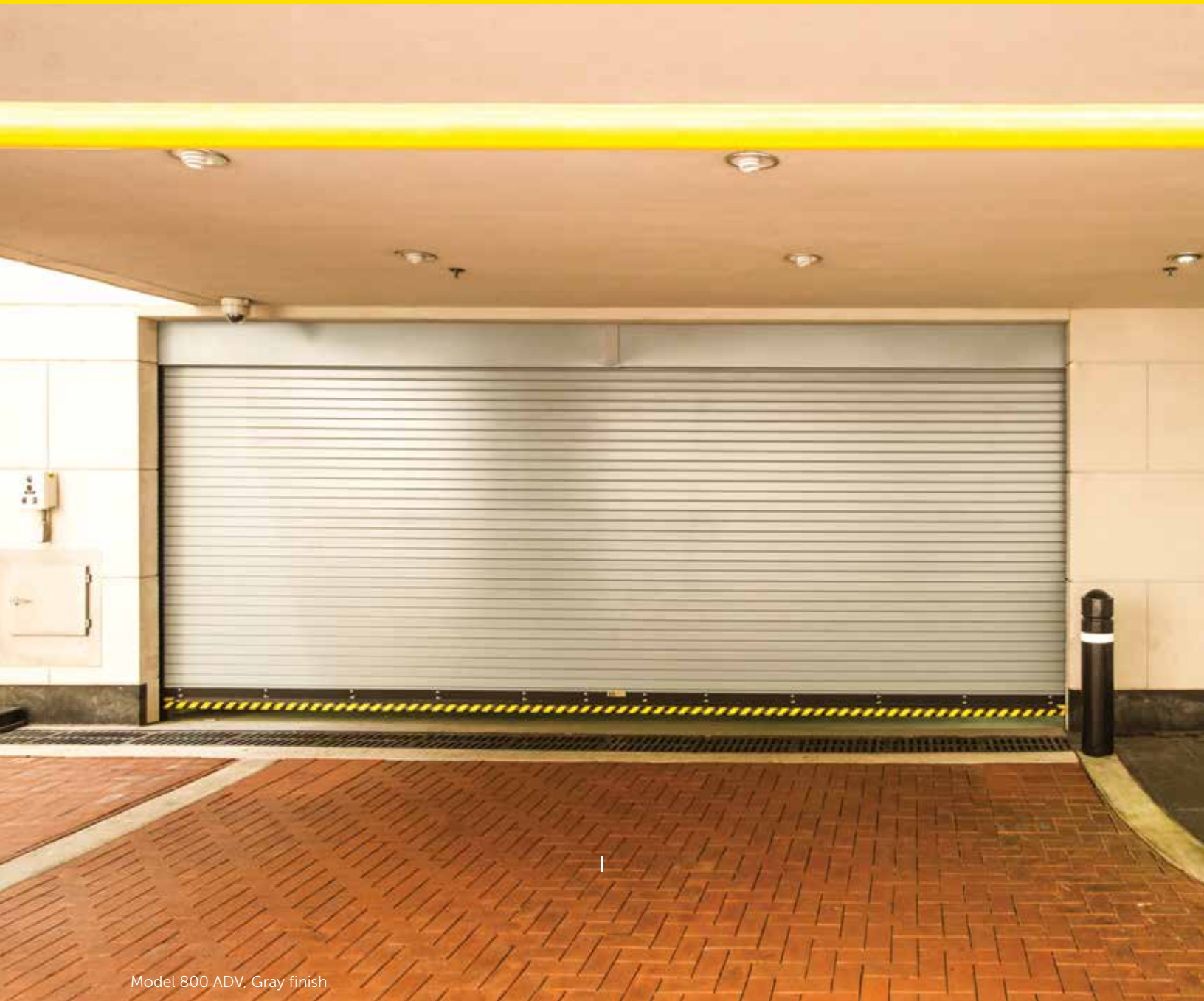
Model 800 ADV, Gray finish