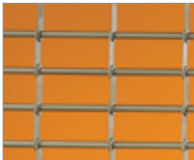
G-8 Pattern 4" (optional)