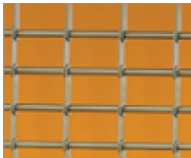
G-3 Pattern 3" (optional)