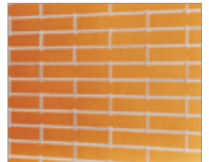
G-1 Pattern 4" (optional) G-1 Pattern modified 3.125"

For technical information, specifications, drawings, visit wayne-dalton.com . Not all patterns available in all sizes. Consult factory for more information.